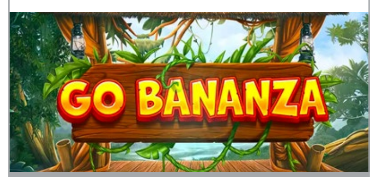
READ THE FULL STORY AT EUROPEAN GAMING

Enjoy some fun monkey business with the latest Booming Games slot: Go Bananza!