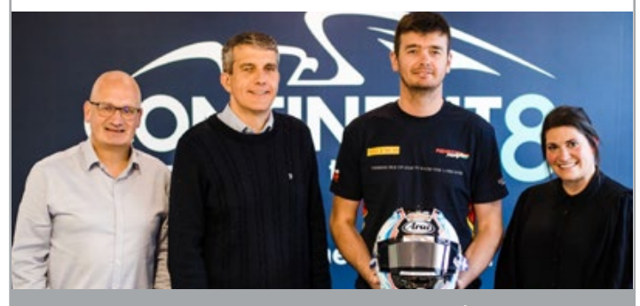
READ THE FULL STORY AT iGg