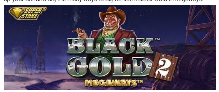
READ THE FULL STORY

Set up the rigs and use your dynamite to destroy all lower symbols, giving you a shot at bigger winnings! Collect four oil rig symbols and gain entry to the free spins round, which features a win multiplier that increases after every reel cascade. To see the money pouring in during the lock and spin bonus game, pick up your drill and dig the many ways to big riches in Black Gold 2 Megaways!