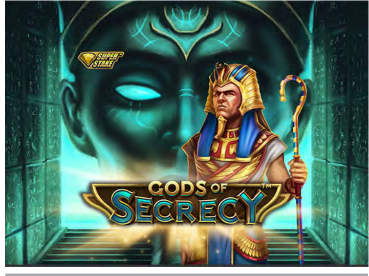
READ THE FULL STORY